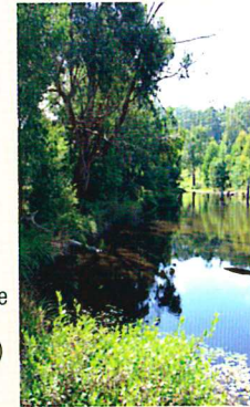
Terrestrial plants including a remnant Eucalyptus thrive above the high water-line (right)