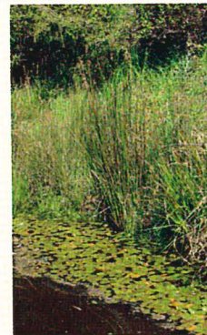
Aquatic plant Nymphoides sp. planted below high waterline (left)

(b) Area of the reserved land inside the fence-line. This will provide a basis for working out the number of terrestrial plants required (those plants that occupy land above the high waterline). Once you have worked out the area of the planting site, calculate the number of plants required. As a rule of thumb, a rate of 1,200 tubestock plants per hectare provides a good starting point.